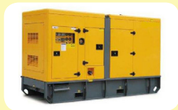
Stand by Generator for common amenities