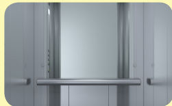
8 Passenger lifts