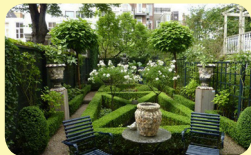
Exclusive Lawn and Garden