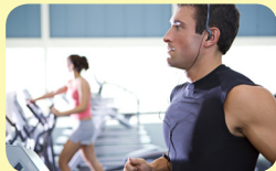
Multipurpose Hall / GYM