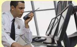
Security cabin with Intercom Connection for Every House