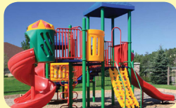
Children's Play court